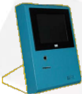
Book Borrowing Kiosk WK2.0