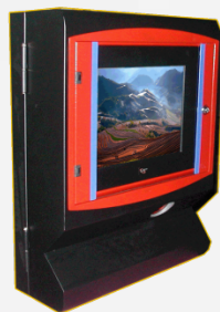
Bar Coding Kiosk WK3.0