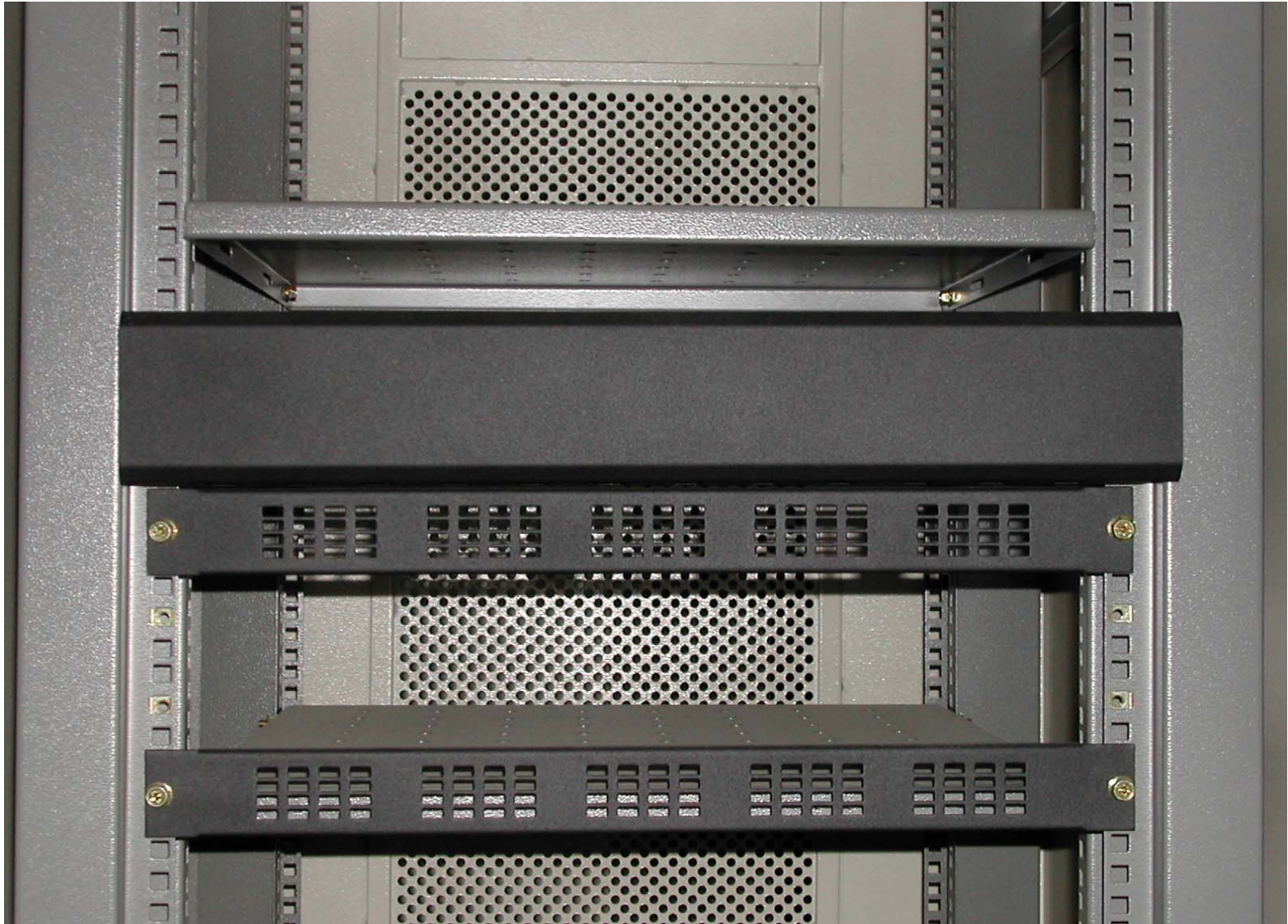
Cable Management Panel, 2U, Horizontal Perforated Panel, 1U