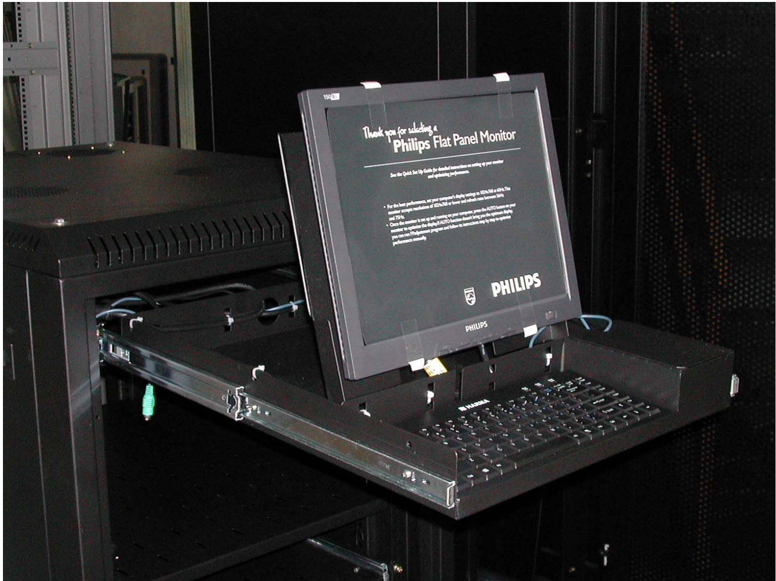
A 1.5U KVM Console mounted on a 27U Server Rack.