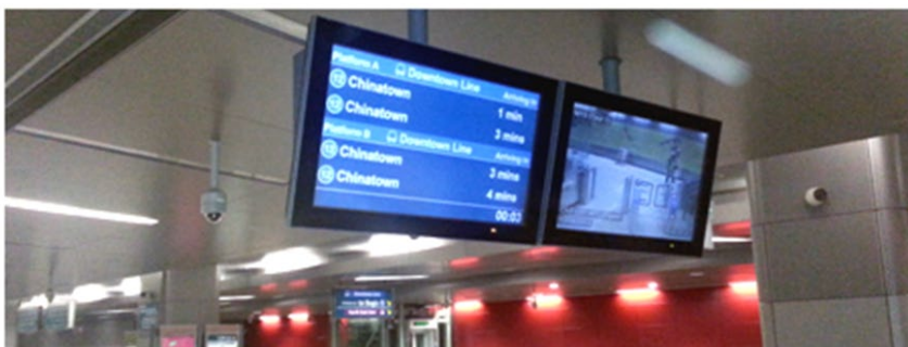
Ceiling Mounted with customized Back to Back pole