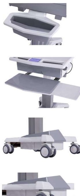
Bin or document holder